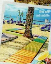
Keep paths and sunbathe