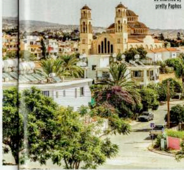
Be charmed by pretty Paphos