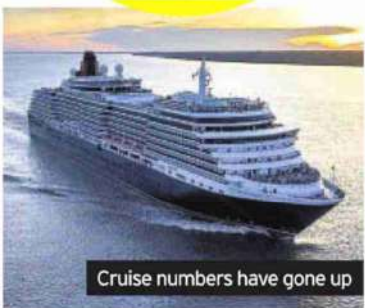
Cruise numbers have gone up