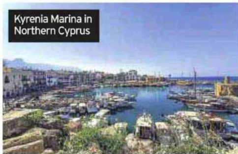
Kyrenia Marina in Northern Cyprus

■ CRUISE holidays are still on the up according to a new report compiled by CLIA (Cruise Lines International Association). Figures show a record 1.9 million holiday-makers from the UK and Ireland took an ocean cruise in 2016. Mediterranean fly-cruises are the