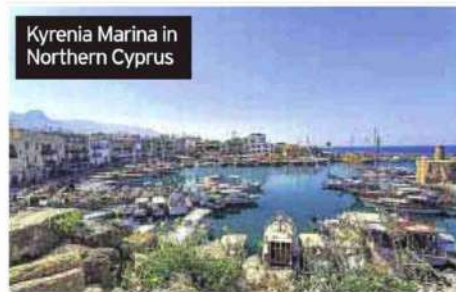
Kyrenia Marina in Northern Cyprus