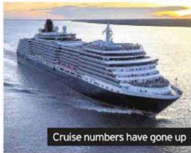
Cruise numbers have gone up