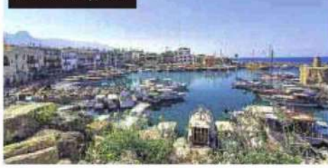
Kyrenia Marina in Northern Cyprus

■ CYPRUS: Sovereign (01293 765 003; www.sovereign.com ) offers seven nights at the five-star Annabelle Hotel (half-board) from £1,045pp - saving up to £729 per couple.