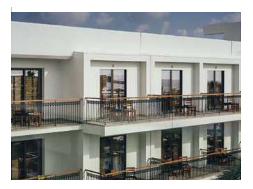
5-stars in Paphos: The Annabelle is surrounded by local shops, tavernas and lively bars, making it the perfect base from which to explore this beautiful part of the island.