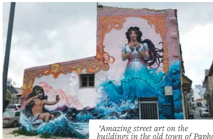
'Amazing street art on the buildings in the old town of Paphos'