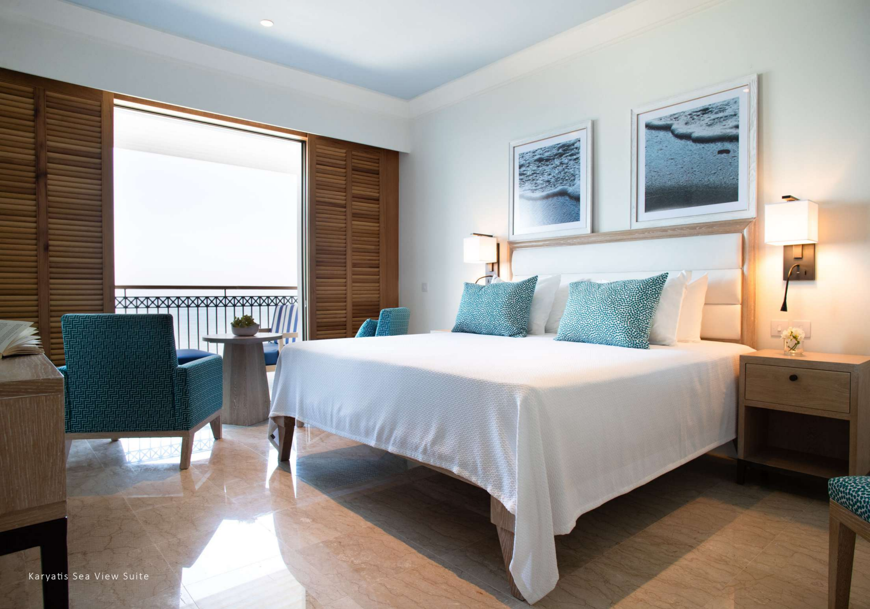
Karyatis Sea View Suite