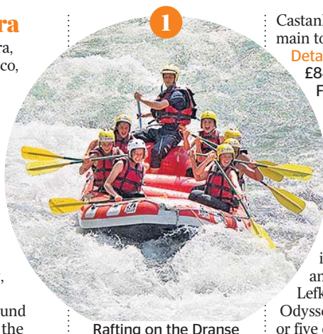
Rafting on the Dranse

The Portuguese island of Madeira, 400 miles off the coast of Morocco, has a spectacularly wild side, with jagged mountain ranges, beautiful coastline and areas of subtropical laurel forest — the last fragments of the great rainforest that once cloaked the island. On a week's holiday you will visit botanical gardens, take an off-road 4x4 tour into the mountains and enjoy a guided walk along the Madeiran levadas , the 16th-century aqueducts that were built to transport water around the island. Accommodation is in the