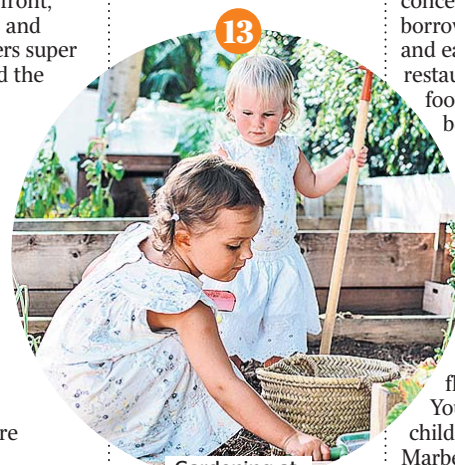
Gardening at Marbella Club

Yoga, archery, cookery, pottery, painting, paddleboarding — even flamenco dancing and perfumery. You name it, chances are the children's entertainment team at the Marbella Club will have it somewhere on their activity list. While the kids are being entertained (activities from £51 per half-day), parents can get thoroughly pampered; this is, after all, one of the Med's longest-standing luxury hotels, once favoured by film stars including Brigitte Bardot and Cary Grant. Details Seven nights' B&B from £2,330pp (marbellaclub.com). Fly to Malaga