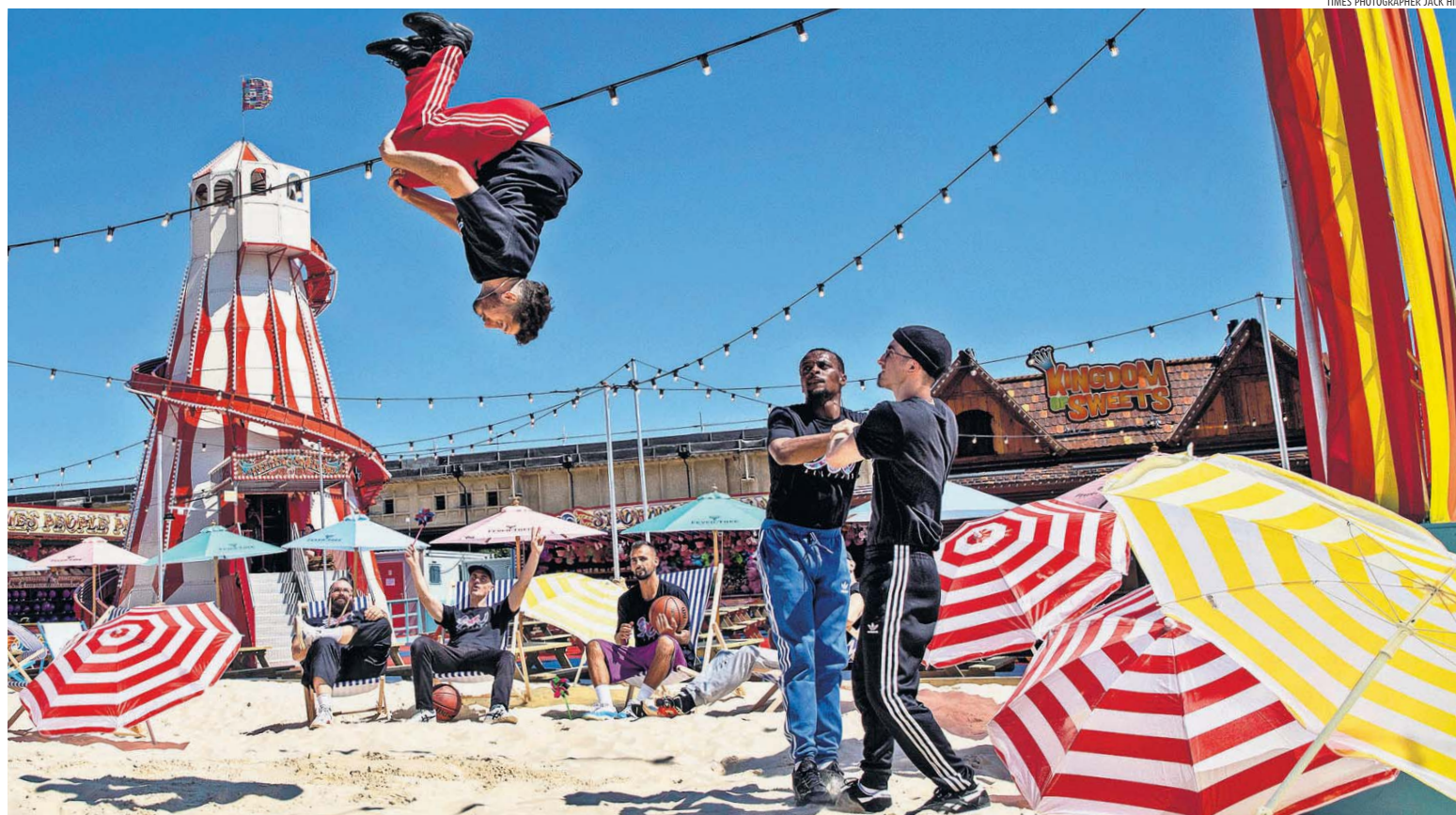
Fun of the fair The London Wonderground festival at Earls Court includes circus acts and a city beach, just the thing as temperatures are forecast to hit 31C. News, page 11