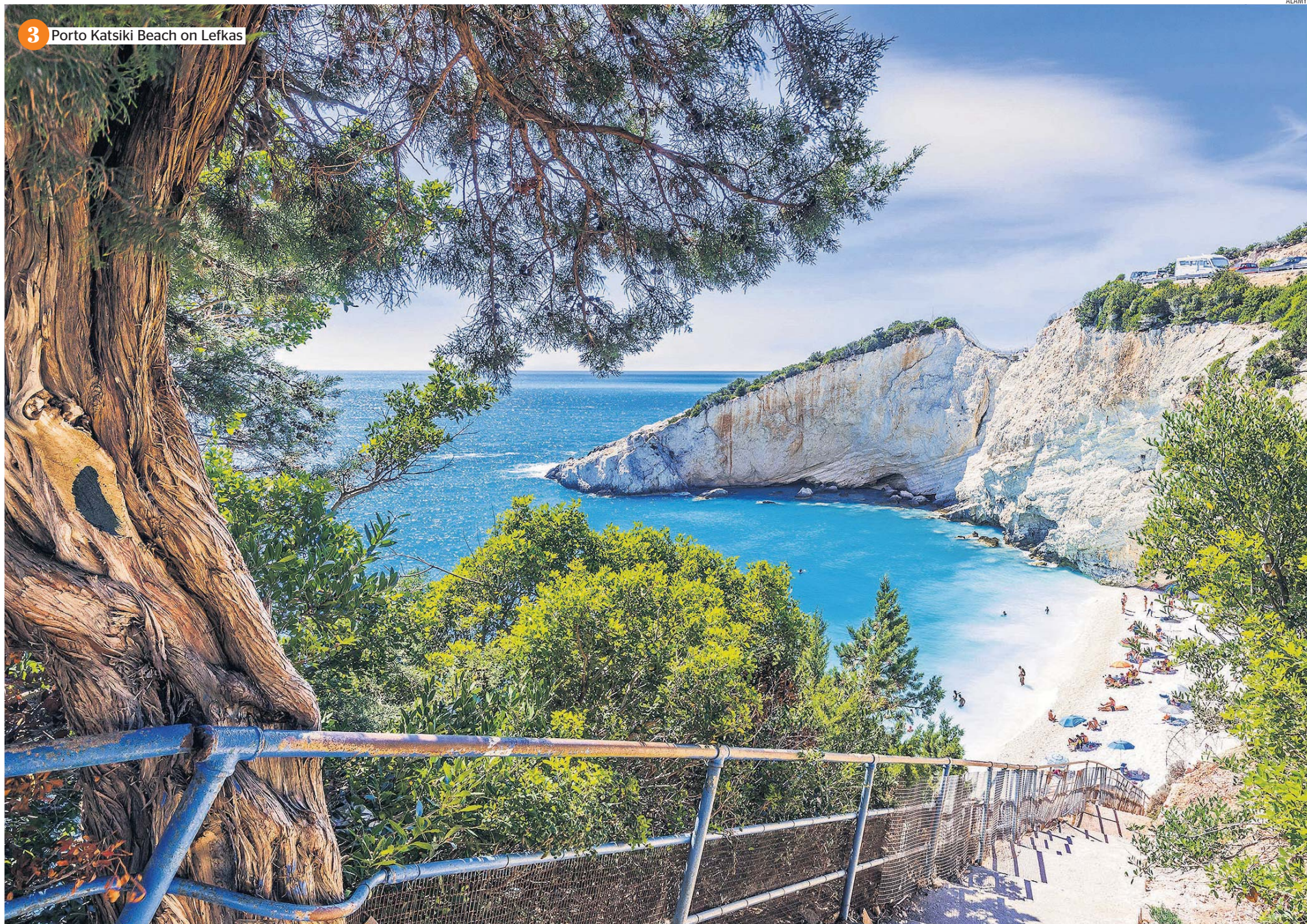
3 Porto Katsiki Beach on Lefkas